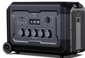
Portable Power Station