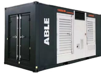
Large Diesel Generators