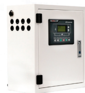
ATS Transfer Switch